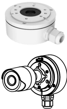
DS-1280ZJ-XS Junction Box